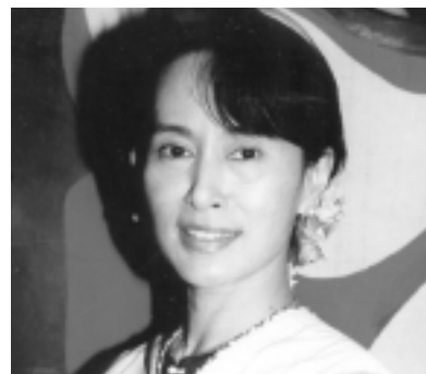
Aung San Suu Kyi