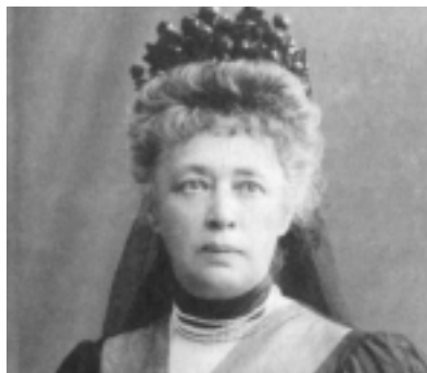
Bertha von Suttner

Baroness Bertha von Suttner and Nobel maintained a correspondence based largely on debates about the most effective route to peace, a subject von Suttner had embraced in the face of increasing European militarism.